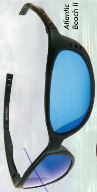
Atlantic Beach II